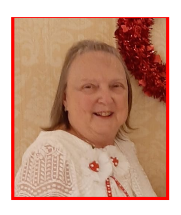
Keep up great work!

Plans are in the works for National La Marche in Pasco, WA in September. Hope you are coming would love to have over 100 partners.